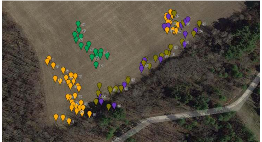
Figure 1: Riparian Rangers LTVCA. Map of trees and shrubs measured at Clearville Creek.

ACER worked with Lower Thames Valley Conservation Authority (LTVCA) to plant 1000 trees and shrubs at Clearville Creek. 90 children and 24 adults from the Boy Scouts did the planting. Some planting were done earlier by machine by LTVCA staff. The species planted were Eastern White Pine, American Elderberry, Red Osier Dogwood, and Black Walnut.