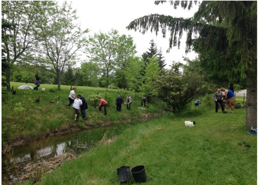
Figure 1: Planting day at Kizell Drain for Riparian Rangers MVCA.

In spring of 2018, ACER worked with Essex Region Conservation Authority (ERCA) to plant 1,000 trees and shrubs at City of Windsor Green Space. We also worked with Mississippi Valley Conservation Authority (MVCA) to plant 1,000 trees and shrubs at Kizell Drain. We measured 10% of what was planted.